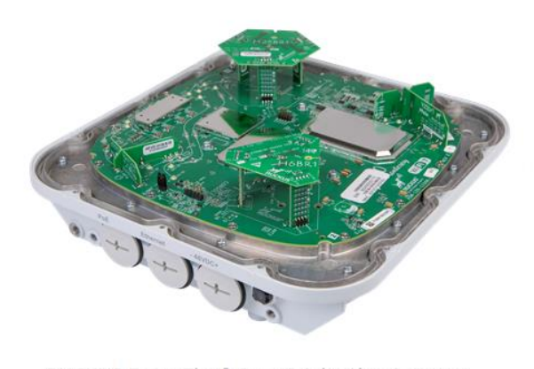
RUCKUS BeamFlex® Smart Adaptive Antenna