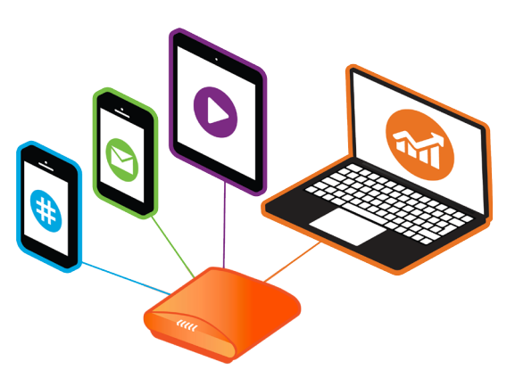
High performing, easy to manage and affordable Wi-Fi

With 8O2.11ac Ruckus Unleashed access points (AP), users can take advantage of higher speeds, better coverage, and improved reliability. Unleashed APs include key Ruckus technologies, such as BeamFlex+ adaptive antenna Technology to maximize signal coverage, throughput, and network capacity, and ChannelFly Technology, our predictive capacity management for RF channel selection. And Zero-IT enables easy device onboarding with several key guest features, such as guest WLAN access, captive portal, Guest Pass, and Custom Logo, to provide key value add services to users.